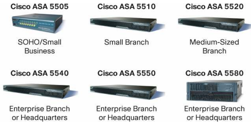
Figure 1. The Cisco ASA 5500 Series Portfolio

Table 2 summarizes the VPN performance of each Cisco ASA 5500 Series model.